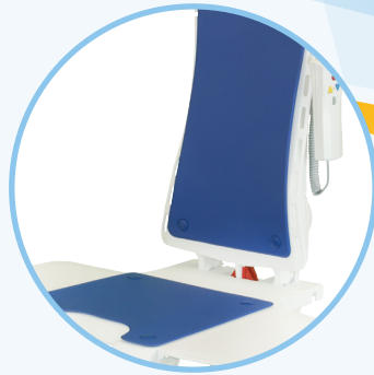
Cover Set Classic Blue