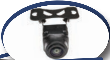
Mini Forward Camera